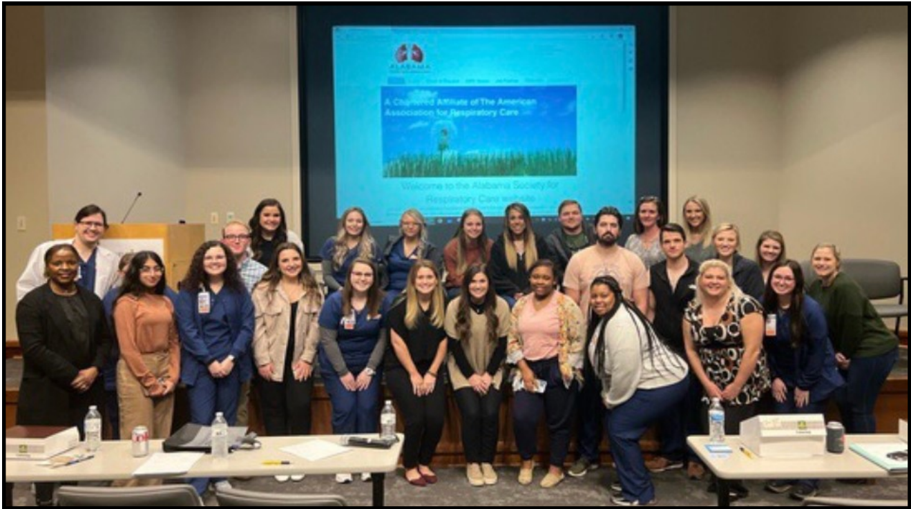
WSCC students at the most recent ASRC Student Symposium