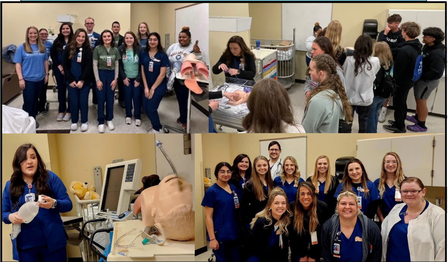
WSCC students have participated in several career fairs over the last few months educating middle and high school students about the Respiratory Therapy profession