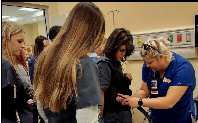
WSCC Career Fair Continued...